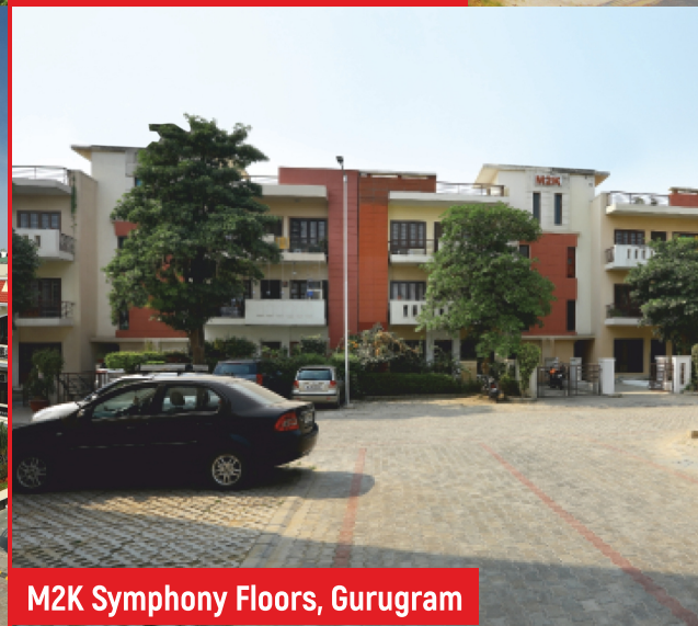
M2K Symphony Floors, Gurugram