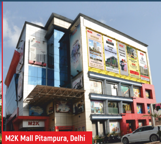
M2K Mall Pitampura, Delhi