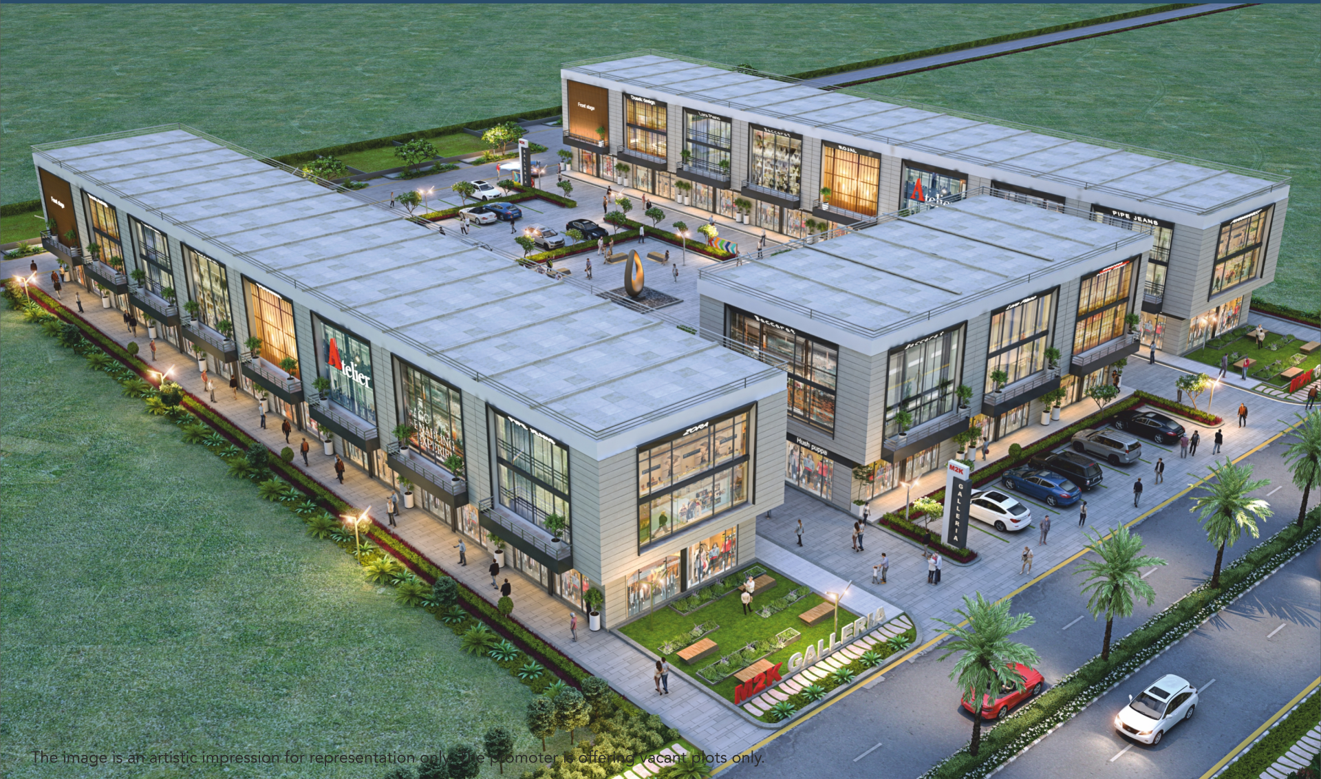
Birds eye view of M2K Galleria