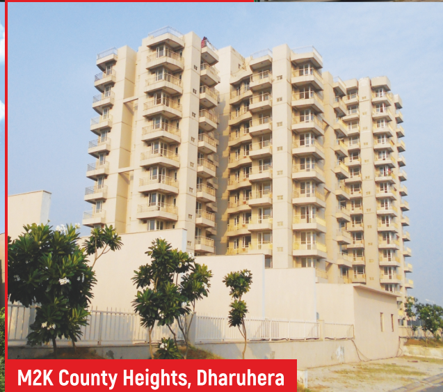
M2K County Heights, Dharuhera