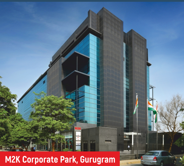
M2K Corporate Park, Gurugram