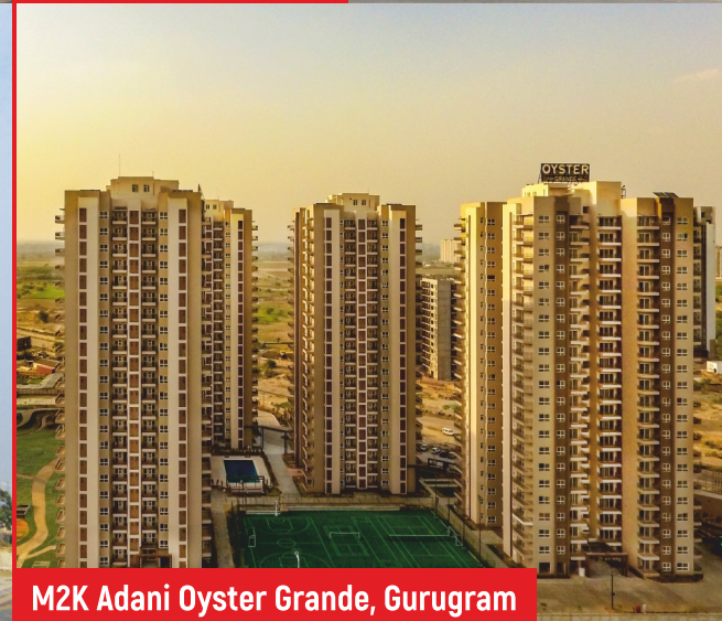
M2K Adani Oyster Grande, Gurugram