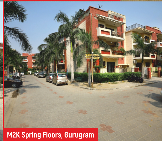
M2K Spring Floors, Gurugram