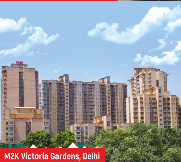
M2K Victoria Gardens, Delhi