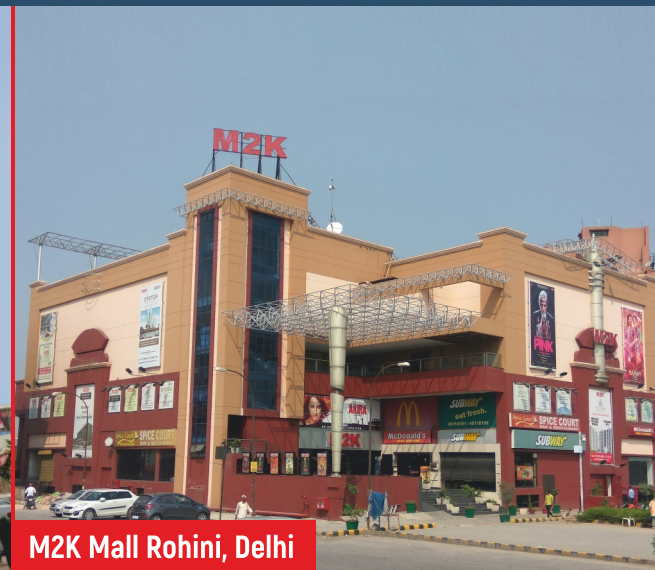
M2K Mall Rohini, Delhi