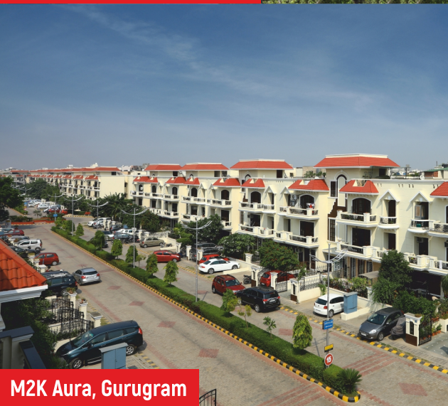
M2K Aura, Gurugram